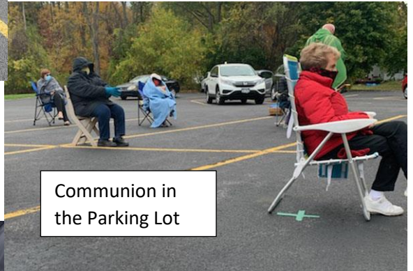
Communion in the Parking Lot