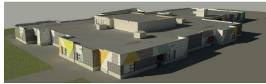
Massing model looking to the South from Brian Good Ave (rear of building)

For all questions, concerns and all other information please contact the File Lead directly.