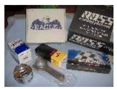
Price $2050.00 Item #: Jeep 4.7 Stroker

HP Forged Stroker kit for a 4.7 AMC. Kit comes with Prorock rods, Ross Racing pistons, Total Seal, Clevlite Rods & Mains. Kit includes custom blueprinted crankshaft. The kit is balanced and the compression is 8.5:1 to 10.5:1. Please specify compression when ordering. Please allow 3 weeks for custom pistons to be made. Price does not include freight.