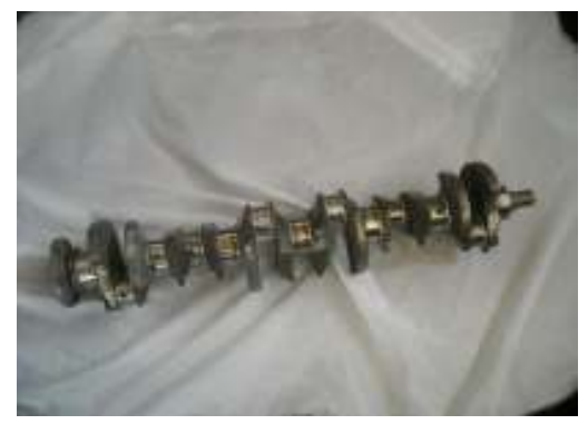
Std rod std main journal stroke 3.895. Rated at 800hp all new 5140 high-grade steel. .090 Radius micro polished and Zero balanced. Will fit all 4.0 and 258 Blocks call for pricing available March

ProRock IBEAM rods Pro Rock stock replacement jeep 4.0 and all Jeep stroker engines with KB pistons or stock pistons I beam rods 4340 cap screws rated 500hp... Stock journal Size p bearing p pin. Rod length 6.125 Price $279.00