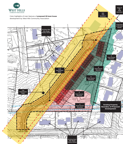
Location and site plan views of proposed development