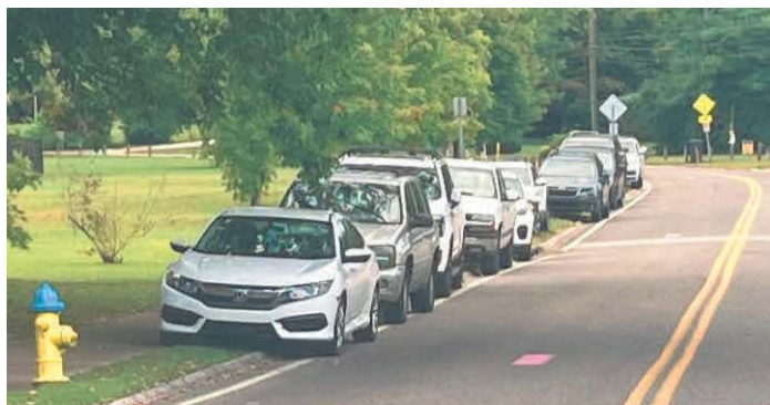
KPD to start ticketing and towing if parking on Sheffield continues. Patrols during peak game times planned.