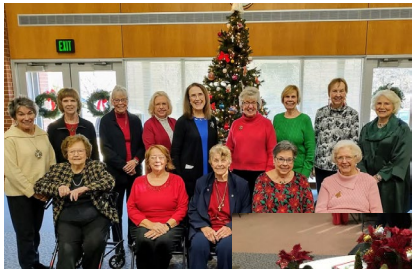
2024 Christmas luncheon for members.