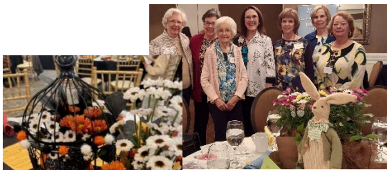
Spring 2024 District IV WH winning arrangement and Fall 2024 District IV WH winning arrangement