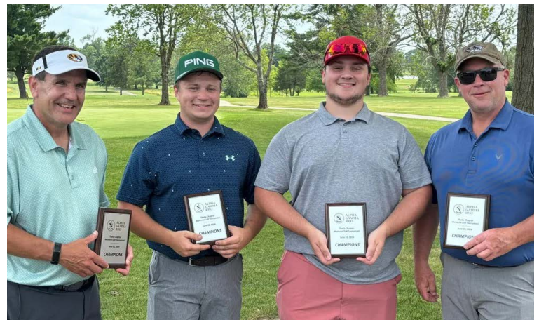
Congratulations to the Theta Chapter Memorial Golf Tournament champions.