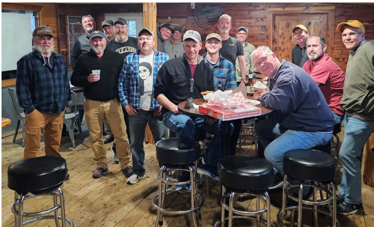
Brotherhood bonds can last a lifetime! Some Theta alumni recently gathered to relax and reminisce.