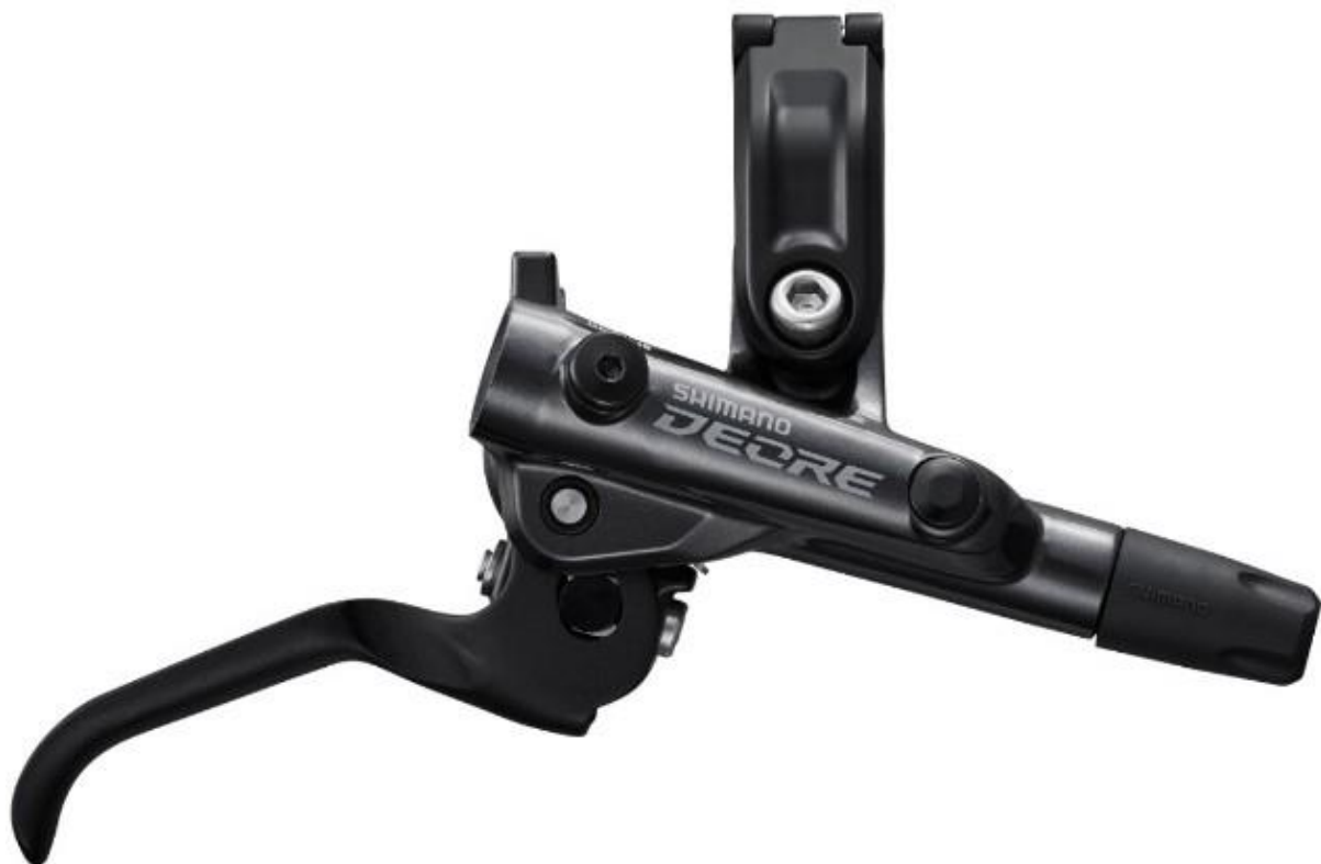
Brake levers SHIMANO, BL-M6100