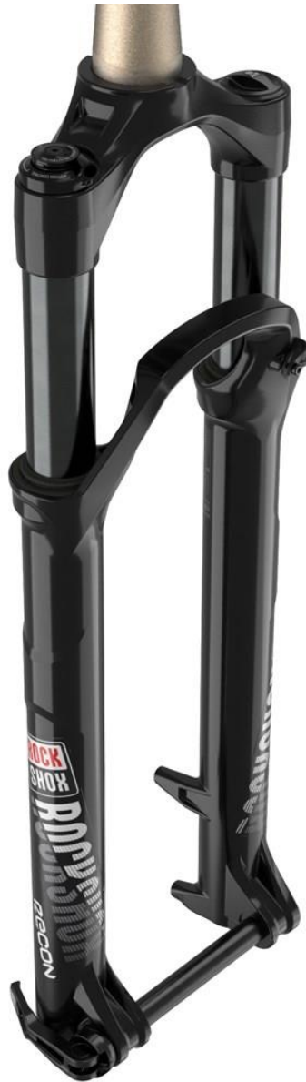
Fork SRAM, Recon RL, Boost Rockshox, 100mm, Axle solo air, Remote Speed Lockout