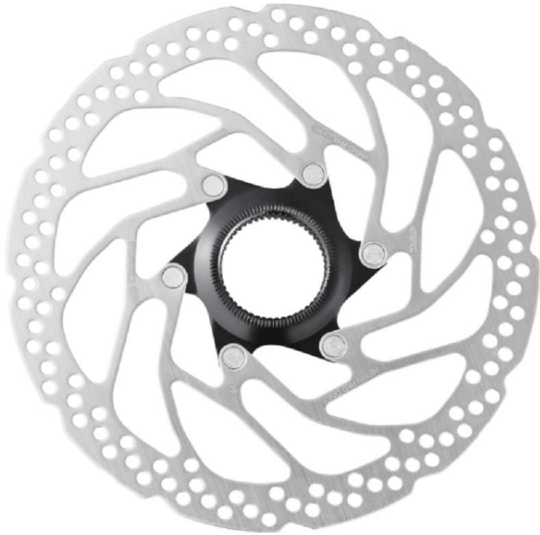
Brake rotors SHIMANO, SM-RT30, R-160mm, F-180mm, Center Lock