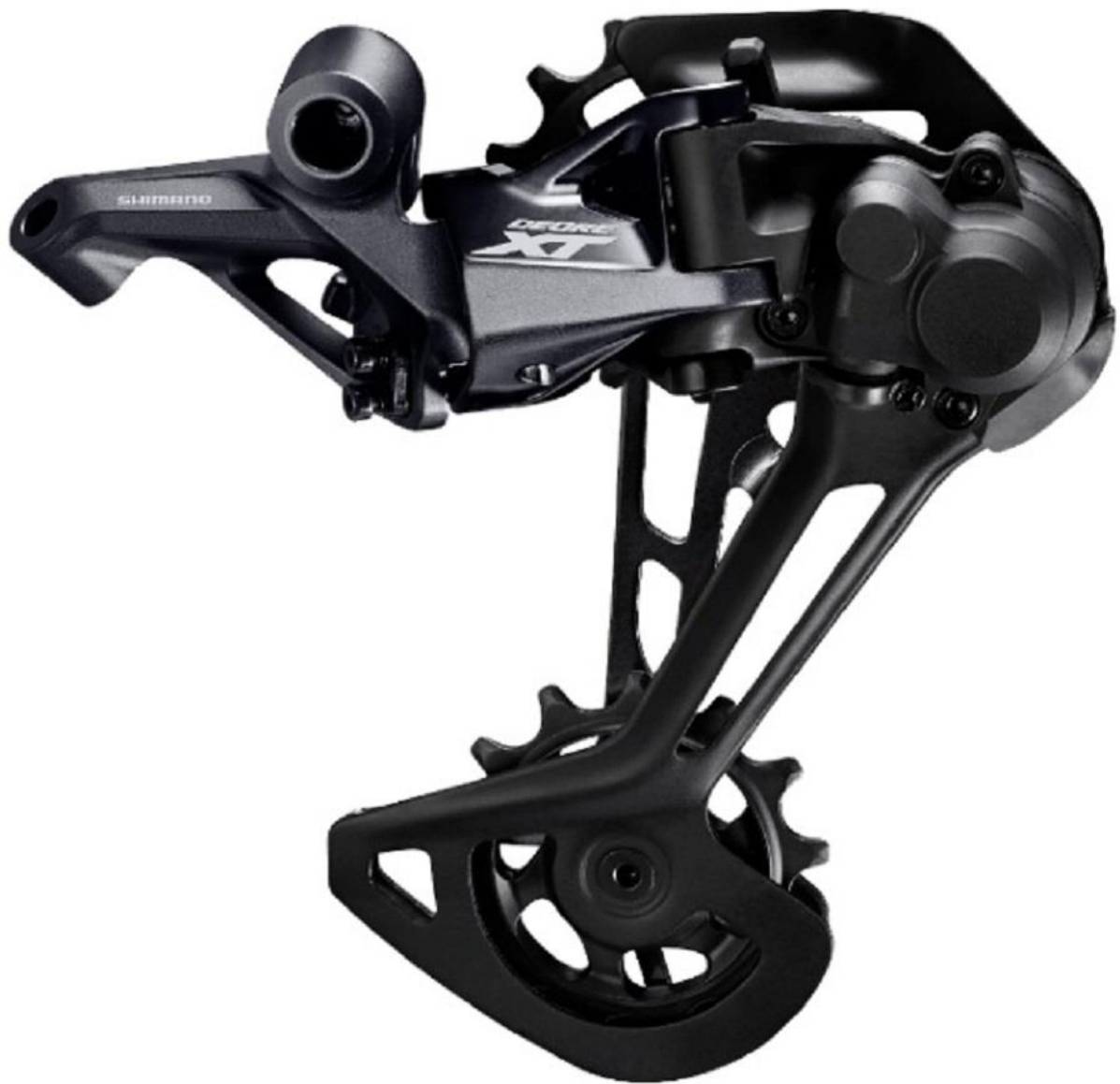
R/derailleur SHIMANO DEORE RD-M8100 XT