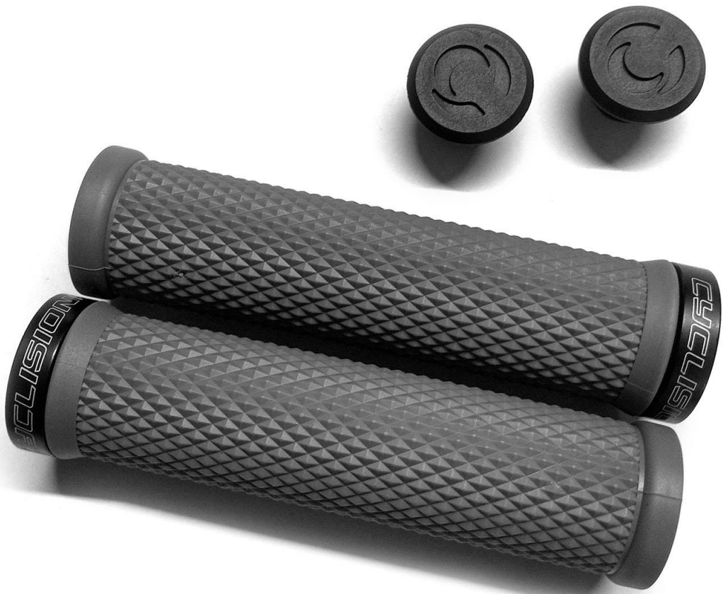
Grips Cyclision one, with Lock on