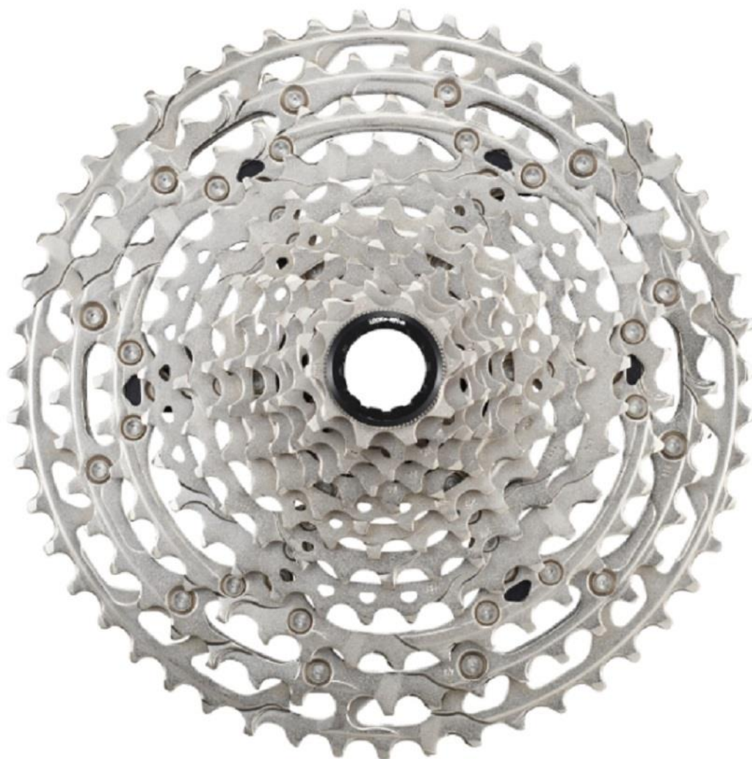
Sprocket SHIMANO, DEORE, CS-M6100-12, 12-SPEED, 10-51T