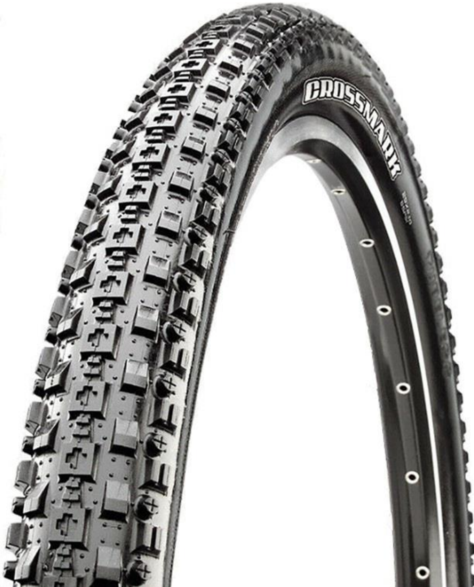
Tires MAXXIS, Crossmax M309P