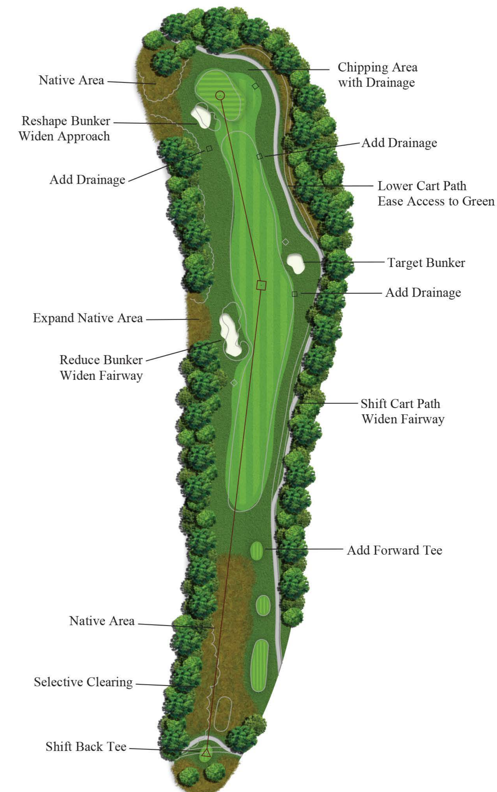
#6 Par 4 Black 377 White 354 Gold 326 Green 292 Red 260

Standing on a nine to ten percent grade and looking up the hill to the second landing area, the massive bunker on the right is imposing. It is also a maintenance challenge and has already been reduced. Its positioning dictates play to the left, but the aggressive play over the bunker should be and is rewarded with an open pitch. Cautious play to the left side will deal with a new bunker added just off the front left collar. Fairway will wrap the green and drainage will be added to ensure quality playing conditions around the green complex.