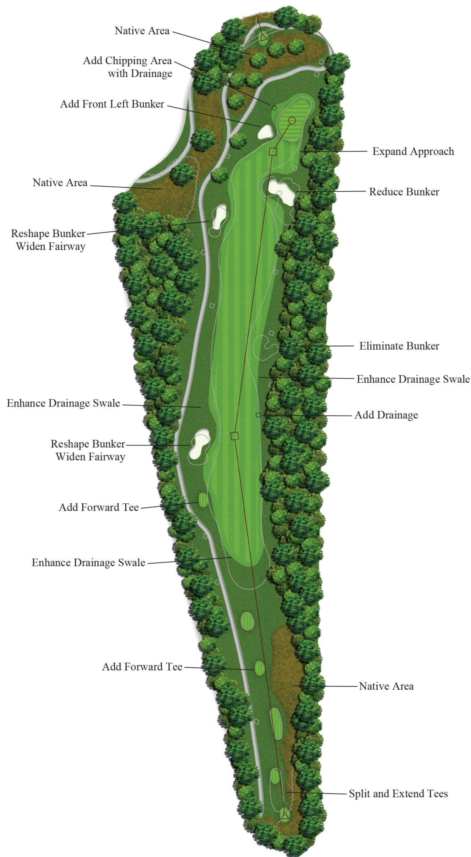
#5 Par 5 Black 492 White 428 Gold 388 Green 355 Red 276

As it currently stands, players must carry three front bunkers and contend with a shallow green on the approach. The small gaps between the bunkers do not offer a fair chance at a run up and there is no reasonable bail out area. The greens complex will become significantly more manageable as the left bunker is removed and the remaining bunkers are shaped closer together on the right. The putting surface will be deeper on the left side, but players will still have to carry the bunkers to access the back right hole locations. The area left of the green will be reshaped to improve drainage, and to create a fairway cut chipping zone for players unwilling to risk taking on the bunkers.