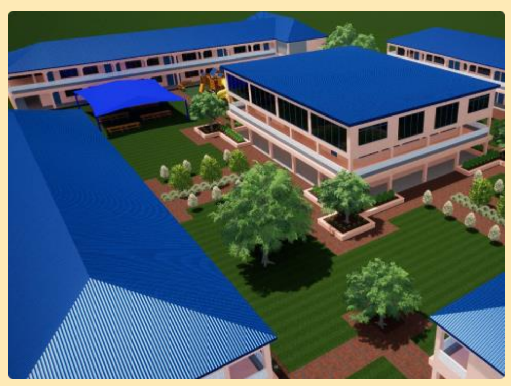
ACM 2024 Impact Goals 11