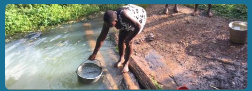
Young girls fetch water from a stagnant groundwater quarter mile from their village in Ghana