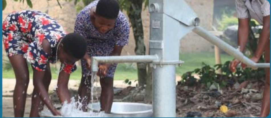
Children enjoying fresh clean water at their village, Ghana.