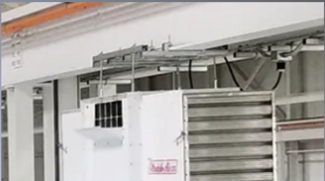
CRANE RAIL MOUNT

ANY MECHANICAL COMPANY ✦ WILL BE CAPABLE OF INSTALLING THESE UNITS, THEY ARE AVAILABLE AS THE UNIT ALONE OR IN A COMPLETE KIT