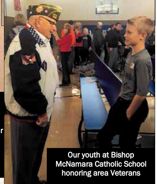
Our youth at Bishop McNamara Catholic School honoring area Veterans