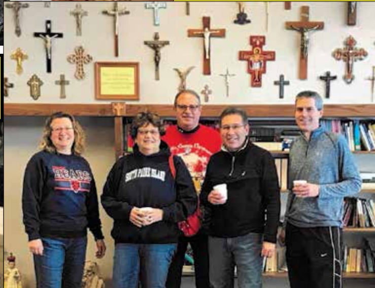
Parishioners from St. James the Apostle church