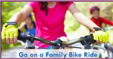
Go on a Family Bike Ride