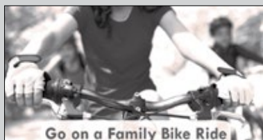
Go on a Family Bike Ride