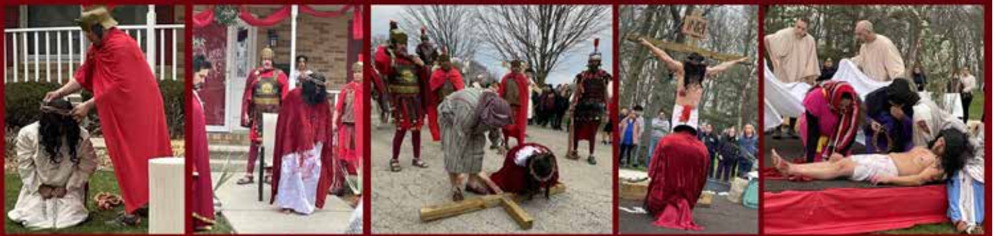
THE PASSION OF OUR LORD JESUS CHRIST 2024