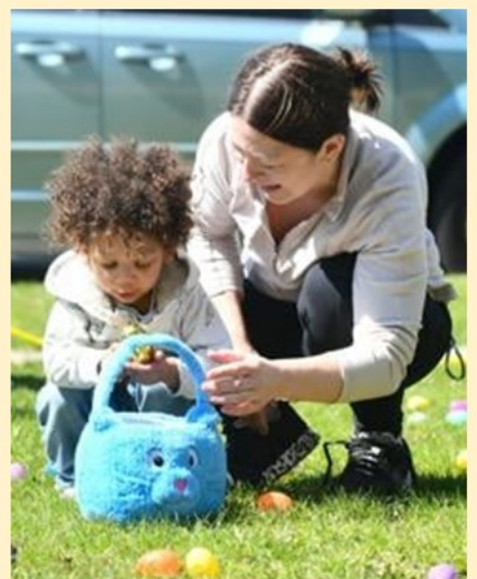
Easter Egg Hunt 2024