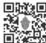
Faith Into Action YouTube (video)