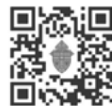
Faith Into Action Podcast (audio)