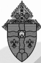
Diocese of Joliet

By including a bequest in your will this spring, you can create a legacy that supports our parish and ministries for years to come.