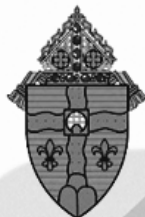
Diocese of Joliet

By including a bequest in your will this spring, you can create a legacy that supports our parish and ministries for years to come.