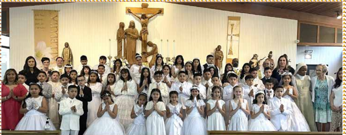
FIRST COMMUNION MASS ON SATURDAY, MAY 6, 2023