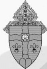
Diocese of Joliet

By including a bequest in your will this spring, you can create a legacy that supports our parish and ministries for years to come.