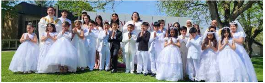
First Holy Communions