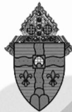
Diocese of Joliet

By including a bequest in your will this spring, you can create a legacy that supports our parish and ministries for years to come.