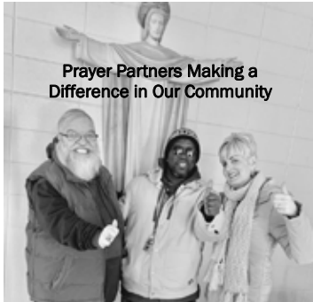
Prayer Partners Making a Difference in Our Community

Every Monday/Cada Lunes 12-5pm First Friday of the month/ Primer viernes del mes 8:00 am-6:00 pm Primer Sábado del mes/ First Saturday of the month Adoración Nocturna/Nocturnal Adoration 8:00 pm-5:00 am