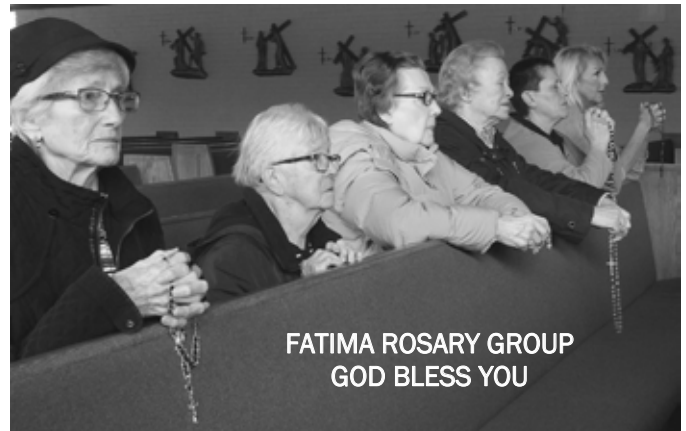
FATIMA ROSARY GROUP GOD BLESS YOU

Our Facebook page is filled with information on our many ministries, upcoming events, links to the bulletin, pictures of past events and inspirational messages. You can also watch the weekend masses live.