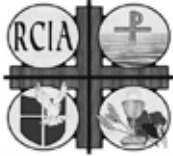
Rite of Christian Initiation for Adults

The Rite of Christian Initiation for Adults is the process by which adults join the Catholic Church.