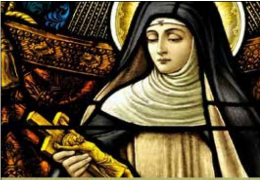
The St. Monica Novena - Aug. 18 - 27th