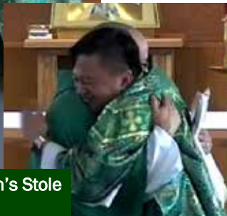
Presentation of a Deacon's Stole