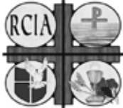
Rite of Christian Initiation for Adults

The Rite of Christian Initiation for Adults is the process by which adults join the Catholic Church.