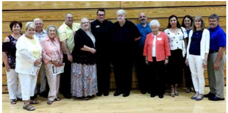
His family and parishioners were in attendance to support him and the other seminarians as they prepared to go back to school.