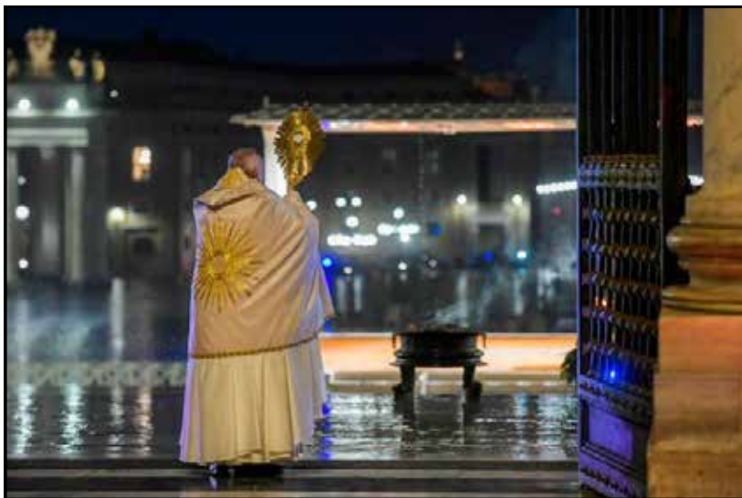
Pope Francis gives the Urbi et orbi blessing after presiding over a moment of prayer in St. Peter's Square. March 27, 2020

**** The Intention of this list is to pray for the seriously ill. Please help us keep the list updated by calling the parish office with any changes. Thank You!