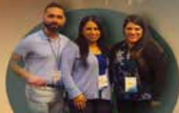
Ministerio de Música GENESIS