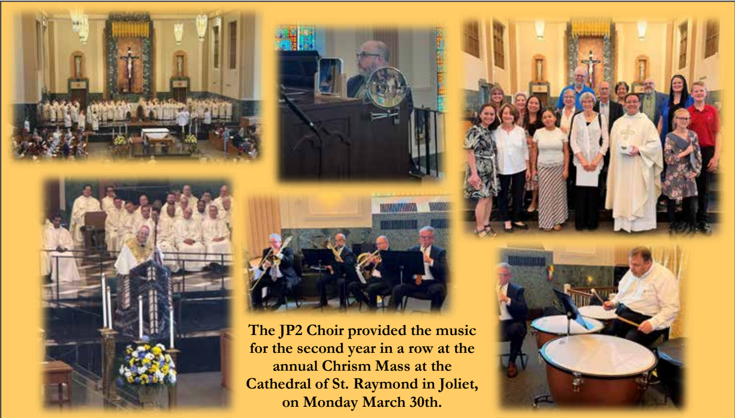
The JP2 Choir provided the music for the second year in a row at the annual Chrism Mass at the Cathedral of St. Raymond in Joliet, on Monday March 30th.