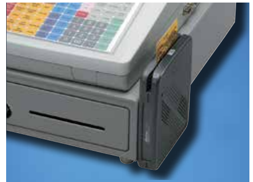
DataTran™ Integrated Credit Option