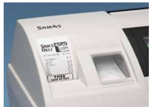
Quick and Easy Drop-in Paper Loading