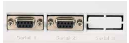
Two Standard RS-232C Ports