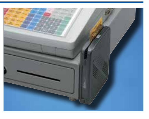
DataTran™ Integrated Credit Option