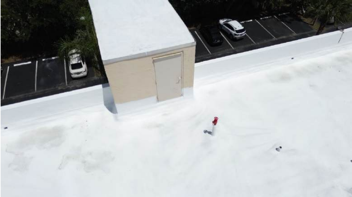
ROOF TO WALL CONNECTION: