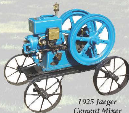
1925 Jaeger Cement Mixer