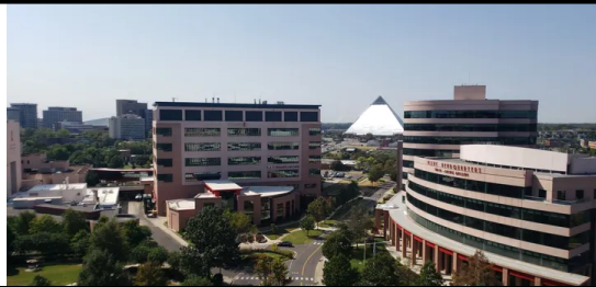
Construction Management (CM)