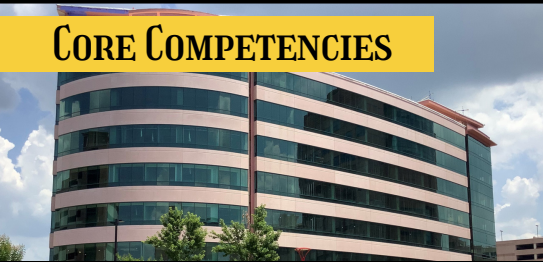
General Contracting (GC)