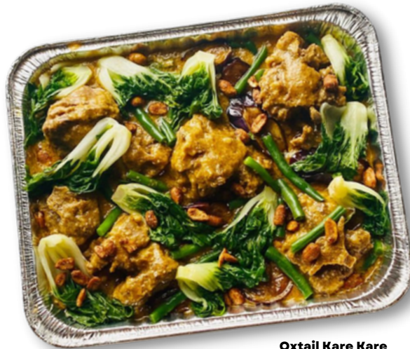
Oxtail Kare Kare

Pork Adobo $70.0 Filipino braised pork in our house marinade.