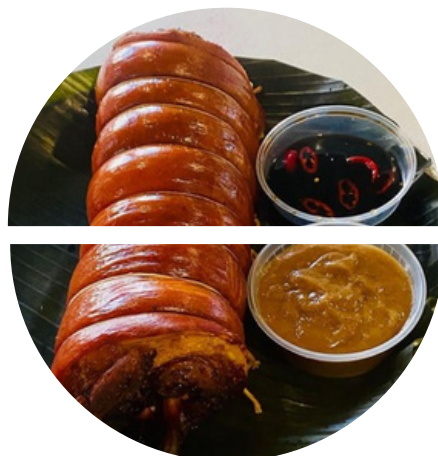
Lechon Belly Log

Pompano fish, BBQ, pancit, chicken adobo, lumpia, slice of our house-made ube flan cake and seasonal fruits. (Bilao platter is customizable; price may vary)