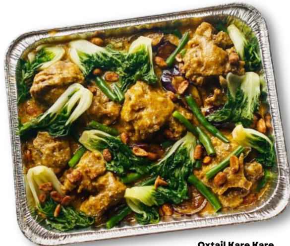
Oxtail Kare Kare

Pork Adobo $70.0 Filipino braised pork in our house marinade.