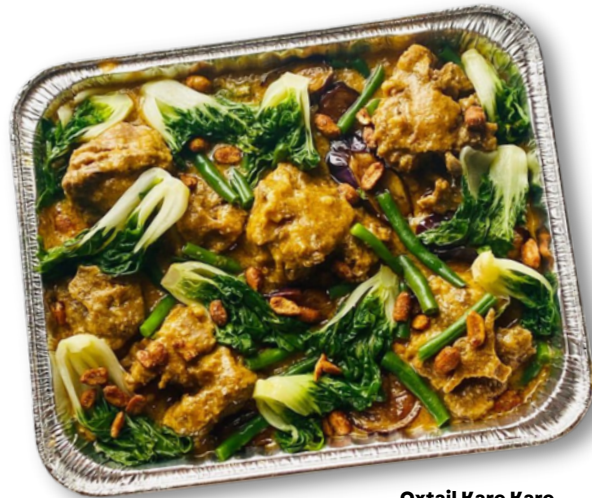
Oxtail Kare Kare

Adobo Ribs K $65.0 Pork ribs braised in our house Adobo marinade.