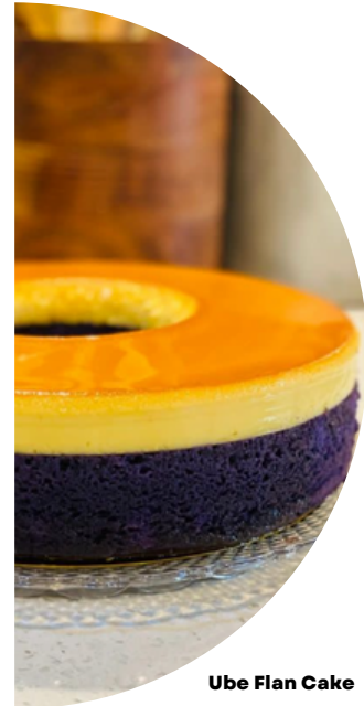
Ube Flan Cake