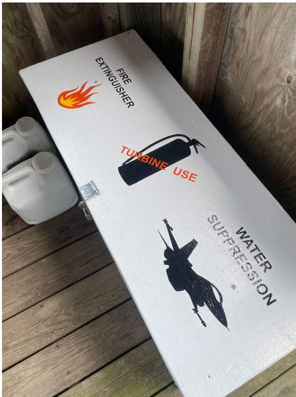
Fire Ext/First Aid (Combo = 911)