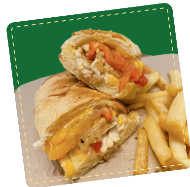
Grilled Chicken 17 Grilled Chicken, Cheddar Cheese, Sautéed Onions, Roasted Bell Peppers, Tomatoes with Garlic Mayo