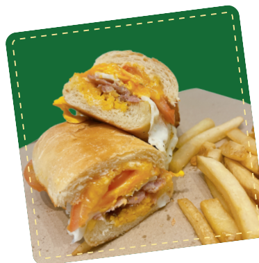
B.E.C 🐷 13 Bacon, Egg and Cheddar Cheese with Mustard Mayo