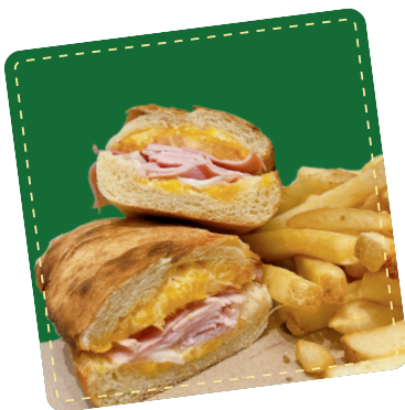
Grilled Cheese & Ham 🐷 16 Ham, Cheese, Tomato with Mustard Mayo