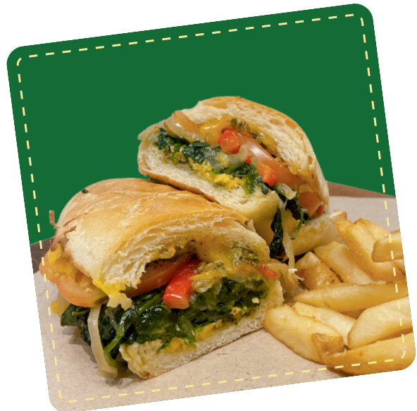
For Vegetarians Only 🌿 16 Tomatoes, Spinach, Mozzarella, Sautéed onion Red Peppers with Pesto