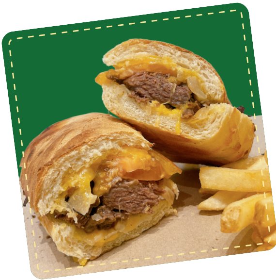
Fernando's Beef 👍 18 Braised Beef, Red Cheddar Cheese, Roasted Onion with Mustard Mayo