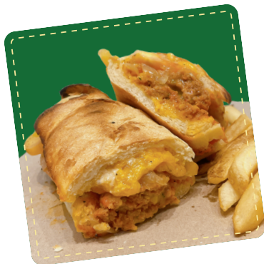
Joey's Meatballs 🐷👍 15 Our Classic Pork Meatballs, Cheese, Tomatoes and Sautéed Onions and Mustard Mayo. How You Doin' ?