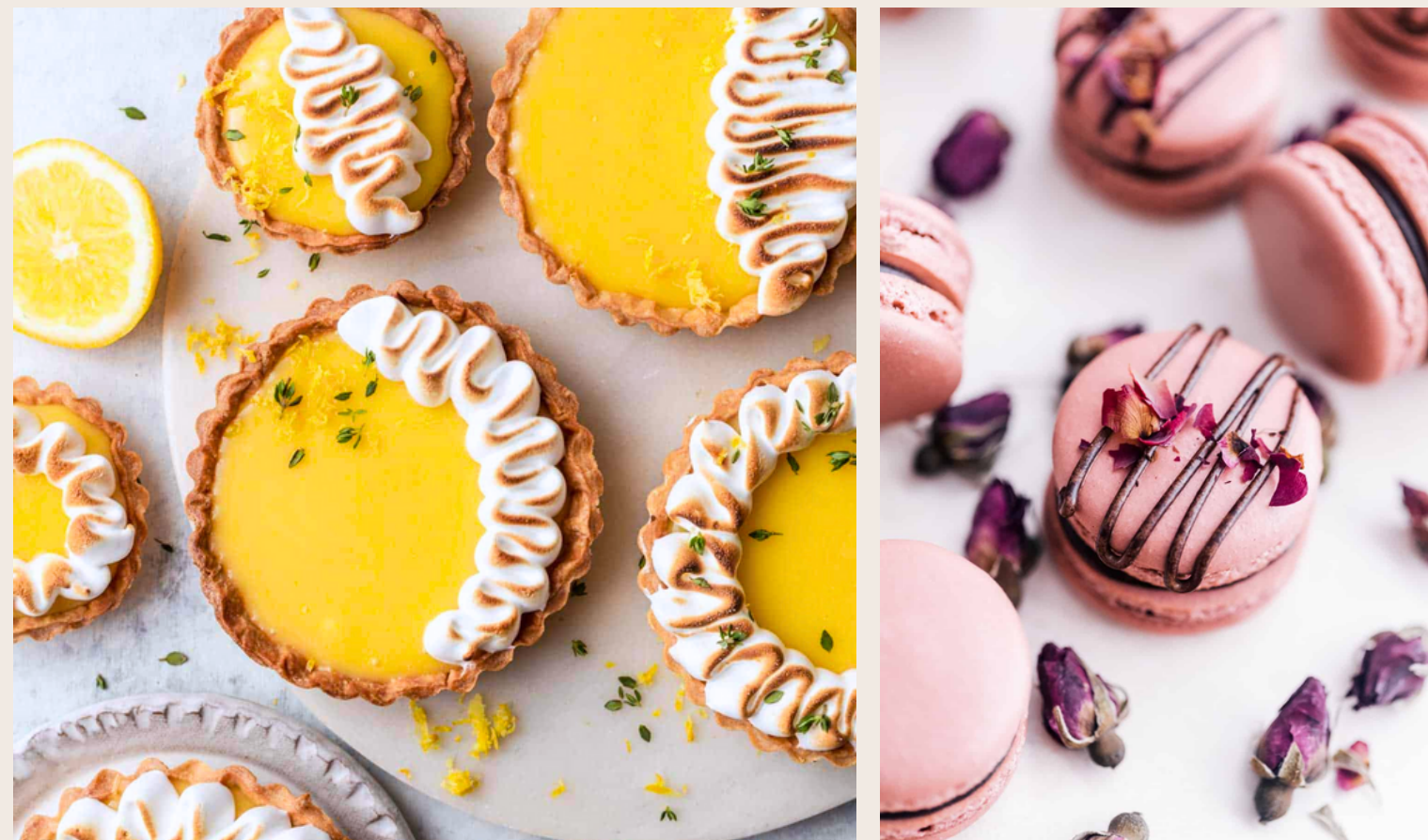
Picture are for illustration purpose. I do not in any way has an affiliation to these photos.

WHETHER IT'S A RICH DECADENT CHOCOLATE, A REFRESHING FRUIT , OR A GOOEY CARAMEL BROWNIE, THESE DELIGHTFUL CREATIONS BRING JOY AND COMFORT TO THOSE WHO RELISH THEIR SUGARY ALLURE.