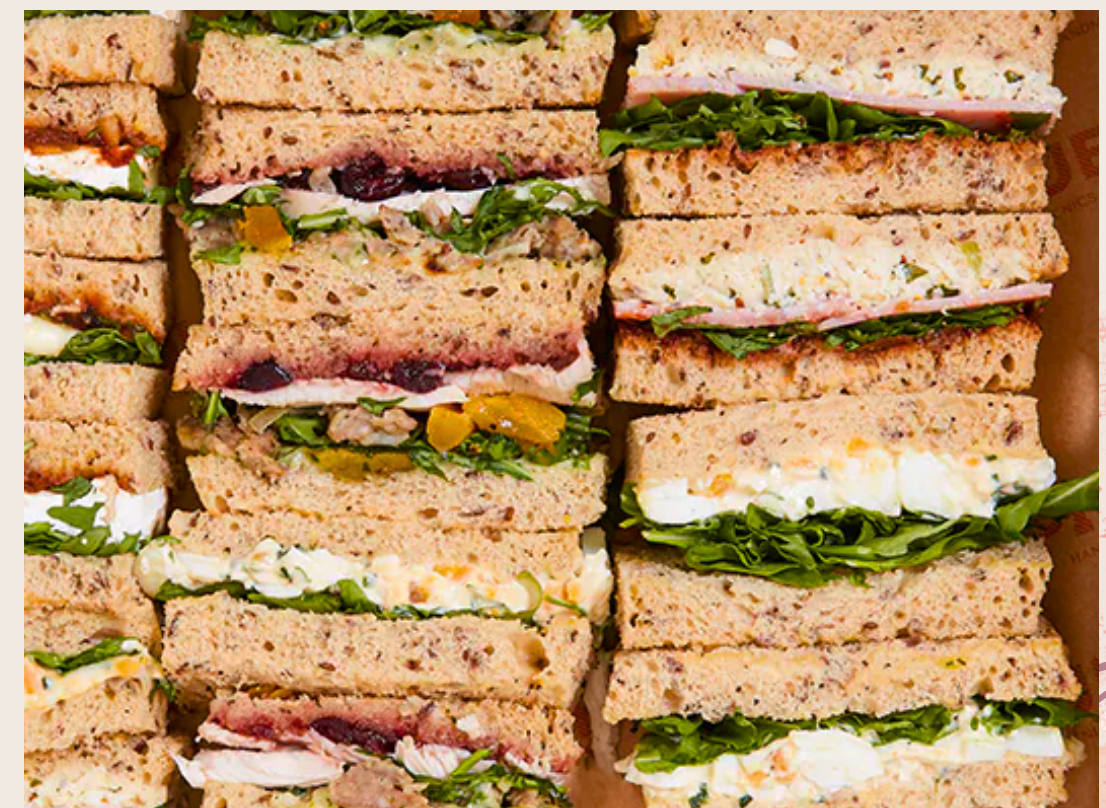
Picture are for illustration purpose. I do not in any way has an affiliation to these photos.