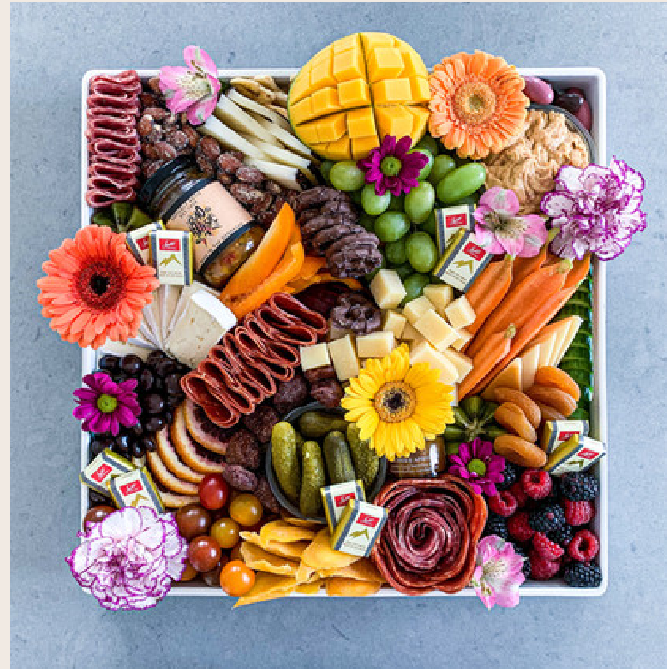
Picture are for illustration purpose. I do not in any way has an affiliation to these photos.

Great for 10-12 pax 4 Cheeses, 3 Meats, 2 dip