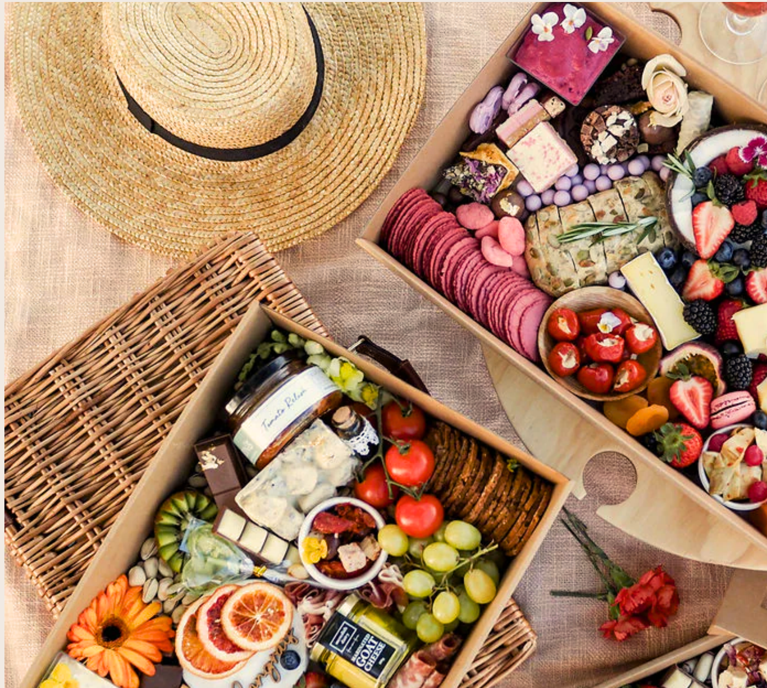
Picture are for illustration purpose. I do not in any way has an affiliation to these photos.

DELIVERED IN READY-TO-GO BOXES, BEAUTIFULLY PREPARED FOR YOUR CONVENIENCE! ALLOW YOUR GUESTS TO QUICKLY GRAB A TASTY AND NUTRITIOUS SNACK WITHOUT ANY FUSS.