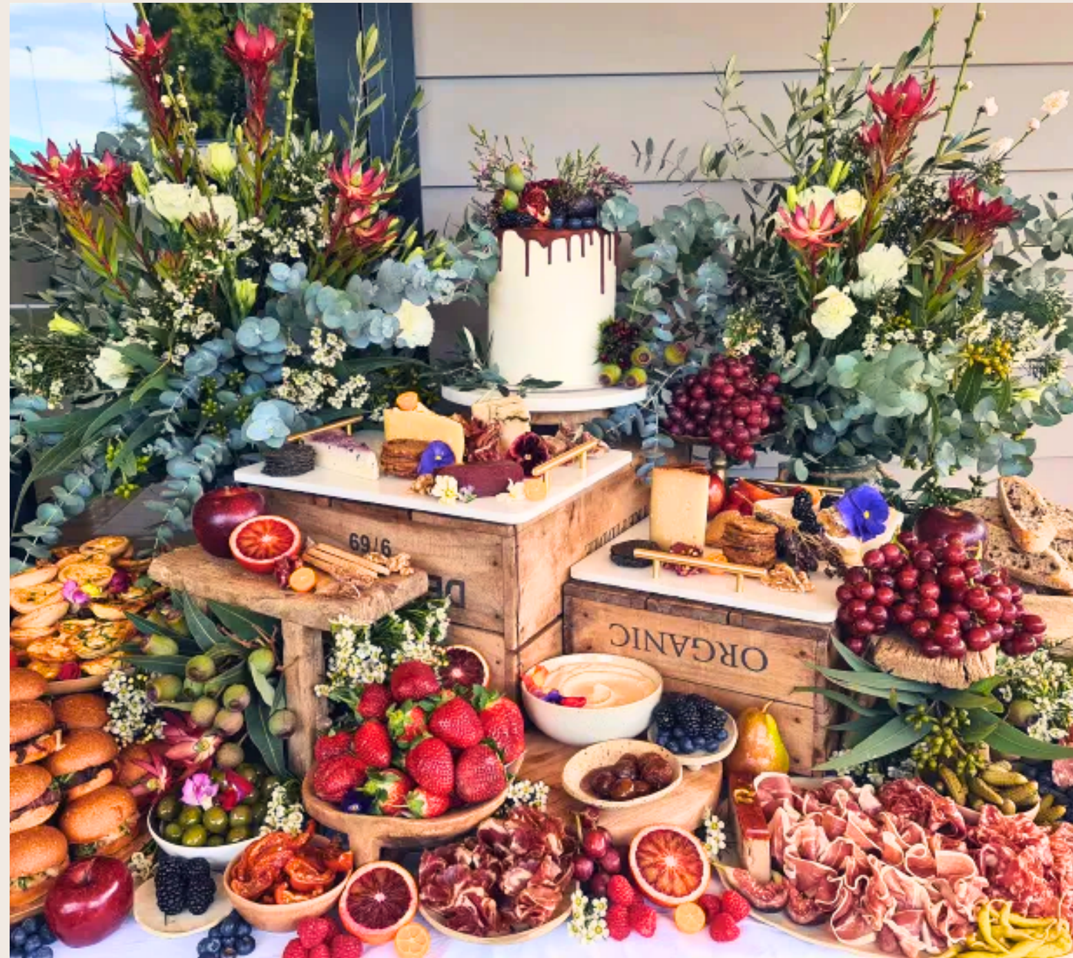
Picture are for illustration purpose. I do not in any way has an affiliation to these photos.

GOURMET GRAZING TABLES THAT WILL BE SURE TO BE A SHOW-STOPPER AT YOUR PARTY! OUR DECORATIVE TIERED SET-UP IS SURE TO WOW YOUR GUESTS AT EVENTS SUCH AS WEDDINGS, BIRTHDAYS, PRODUCT LAUNCHES, CORPORATE EVENTS AND SOCIAL EVENTS!