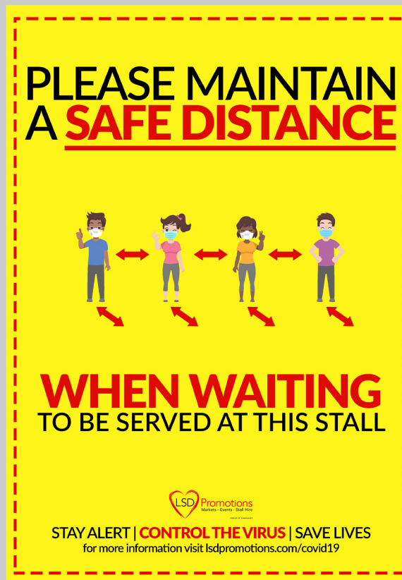
Image 1. Our current head and site office hygiene policy