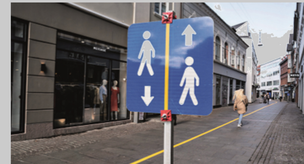
an example of a one way system in Denmark.