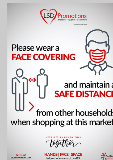
Face Covering Signage