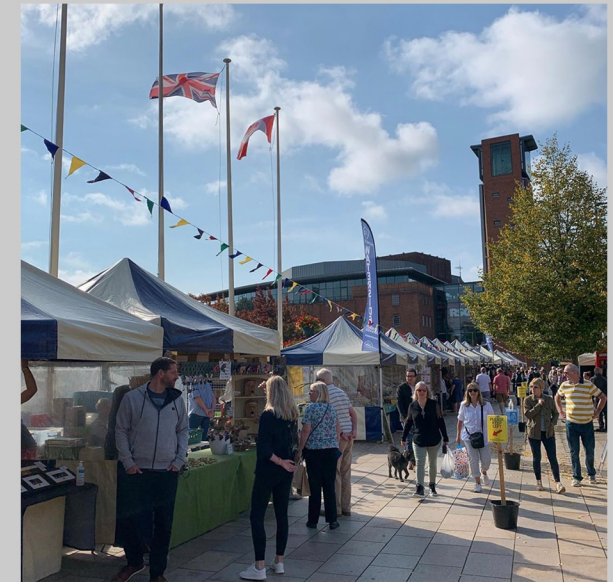
Example of our 'Keep Left' one way system