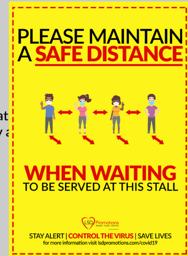
Safe Distance Sign