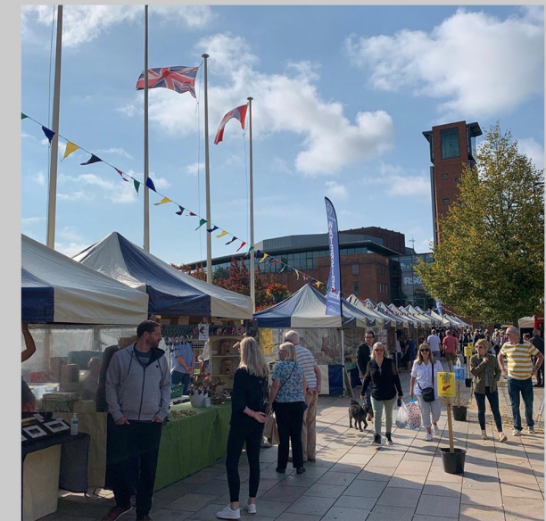
Example of our 'Keep Left' one way system