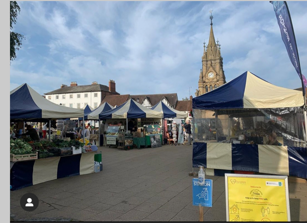
Example of our Covid-19 Signage & Hand Sanitizer Station