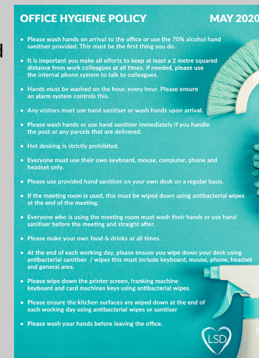
Office Hygiene Policy