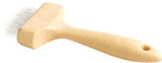
PLATE PO S12 CTD

Thick mini waffle pop-out plate for Waffle Iron.