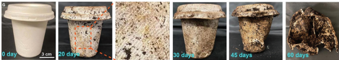
This image shows the decomposition of the biodegradable tableware over 60 days.

While our proprietary sugarcane bagasse can be recycled, it also will fully decompose in 180 days in soil or water. No trees or wood is used in the production of these products.