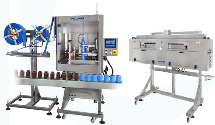
AFM SLEEVERS & NECK BANDERS