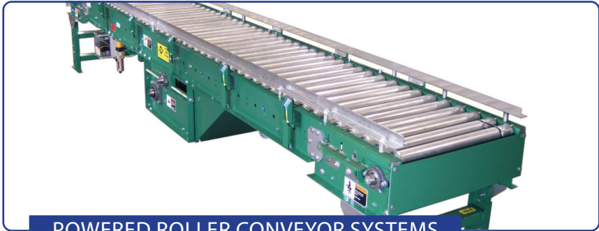
POWERED ROLLER CONVEYOR SYSTEMS