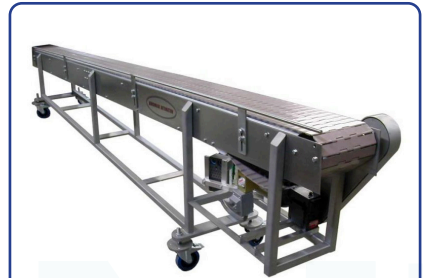
TABLE TOP CHAIN CONVEYORS