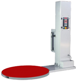
EAGLE 2000 B