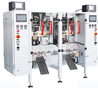
FULL BAGGING SYSTEMS