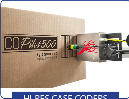
HI-RES CASE CODERS