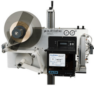
PRINT & APPLY SYSTEMS