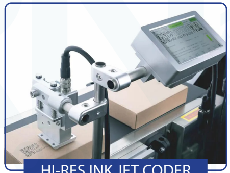
HI-RES INK JET CODER