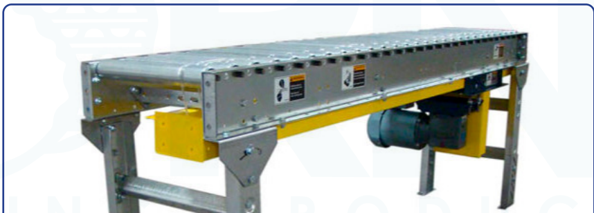
PALLET CONVEYOR SYSTEM