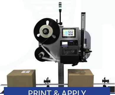
PRINT & APPLY