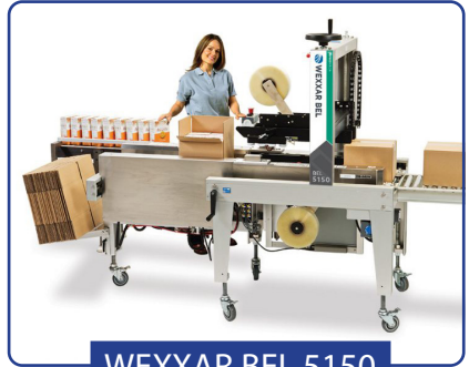
WEXXAR BEL 5150