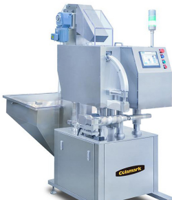
COLAMARK DESICCANT INSERTER