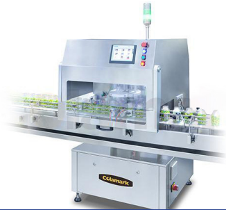
COLAMARK COTTON INSERTER