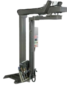
ORION FLEX RTD