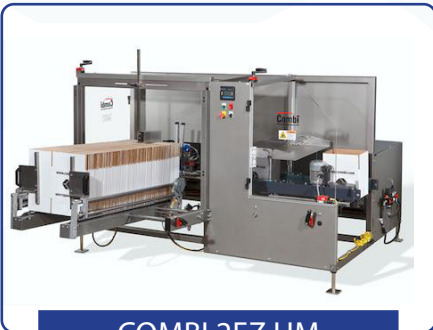
COMBI 2EZ HM