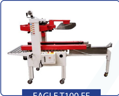
EAGLE T100 FF