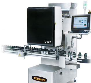
COLAMARK V-120 COUNTER