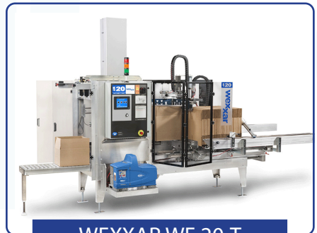
WEXXAR WF 20-T