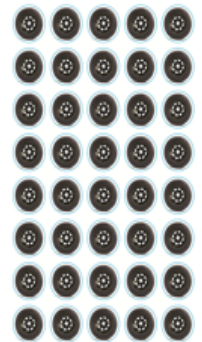
40 Tire Tokens