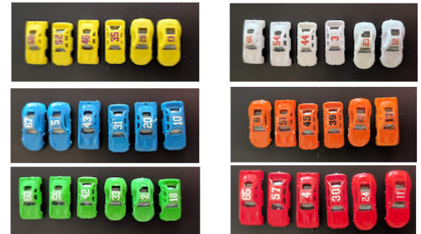
36 Race Cars (six teams of six different colors)