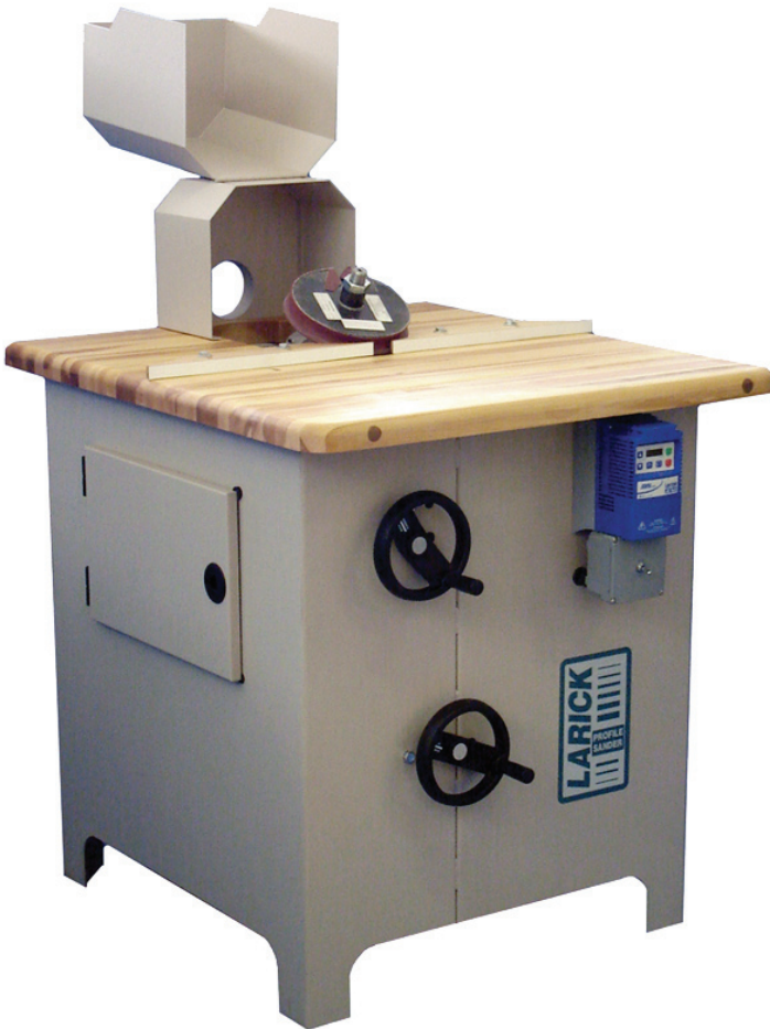
MODEL 361, 362, 364