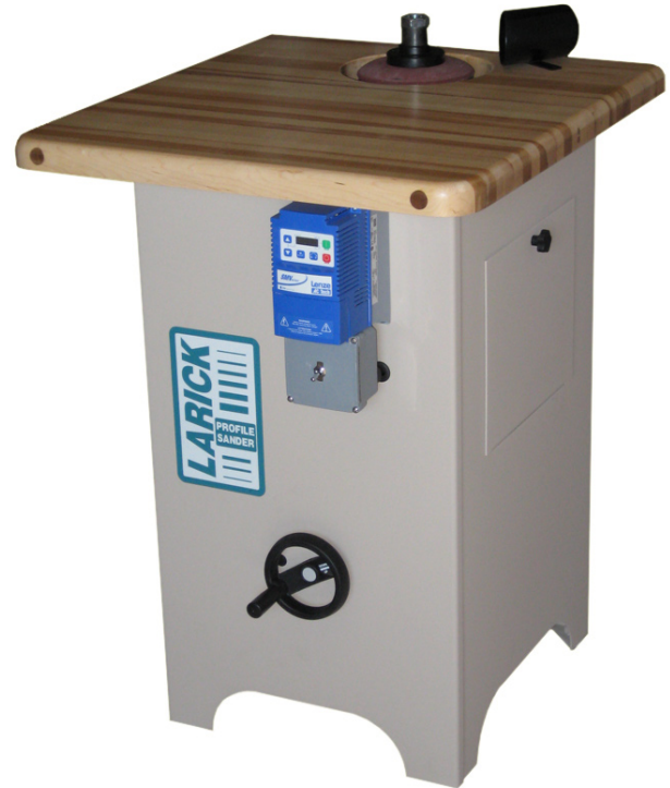
MODEL 151, 152, 154