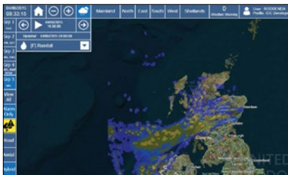
Live Weather Data with Business Alarms