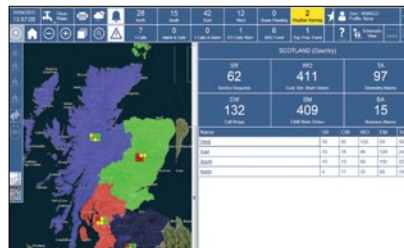
The Situational Awareness Application