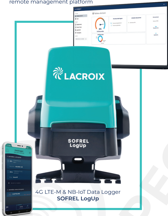
4G LTE-M & NB-IoT Data Logger SOFREL LogUp