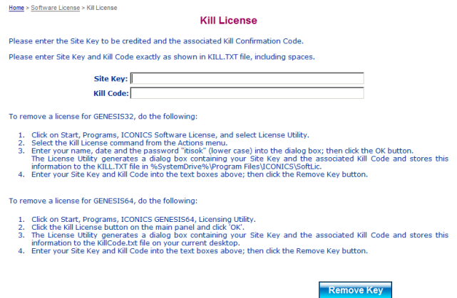
Figure 1 - Site Key/Kill Code Dialog